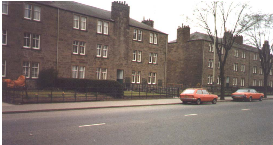
287 Strathmore Avenue 1989