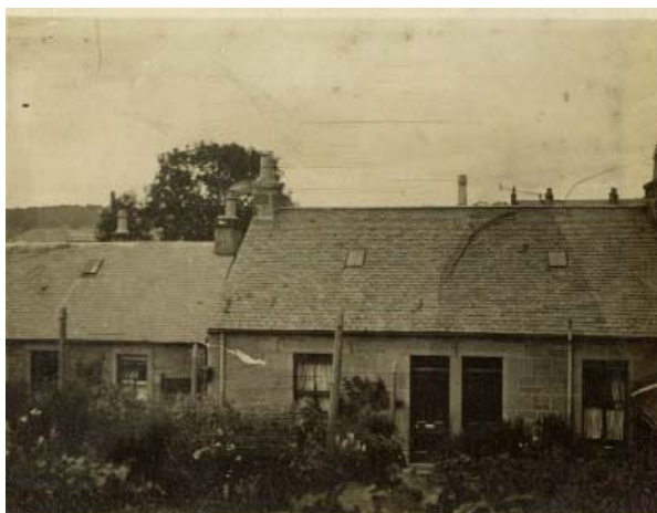
Kirk Street Cottages