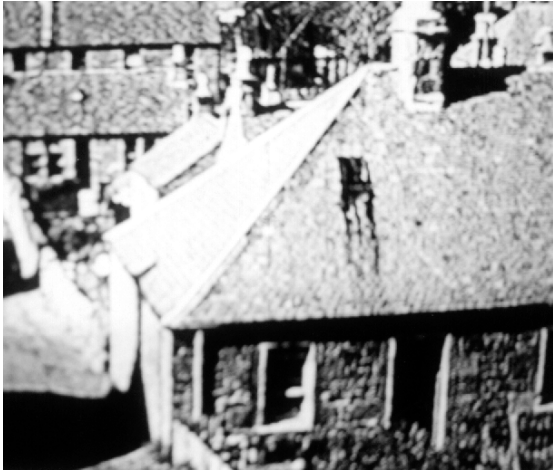
Kirk Street (on left) and Bible Row,