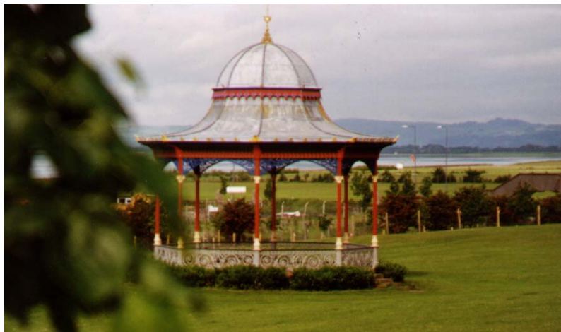
Magdalen Green Band Stand 1998