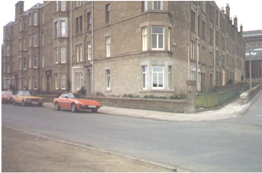
85 Magdalen Yard Road in 1998