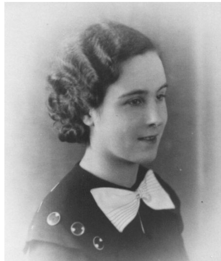
Nan aged around 19