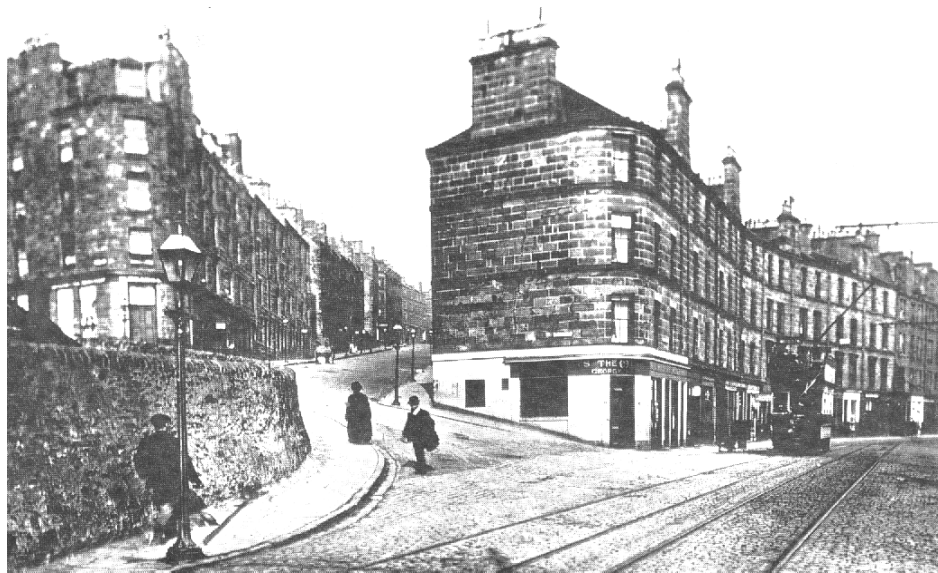
Watson Street to the left, Ferry Road to the right circa 1905