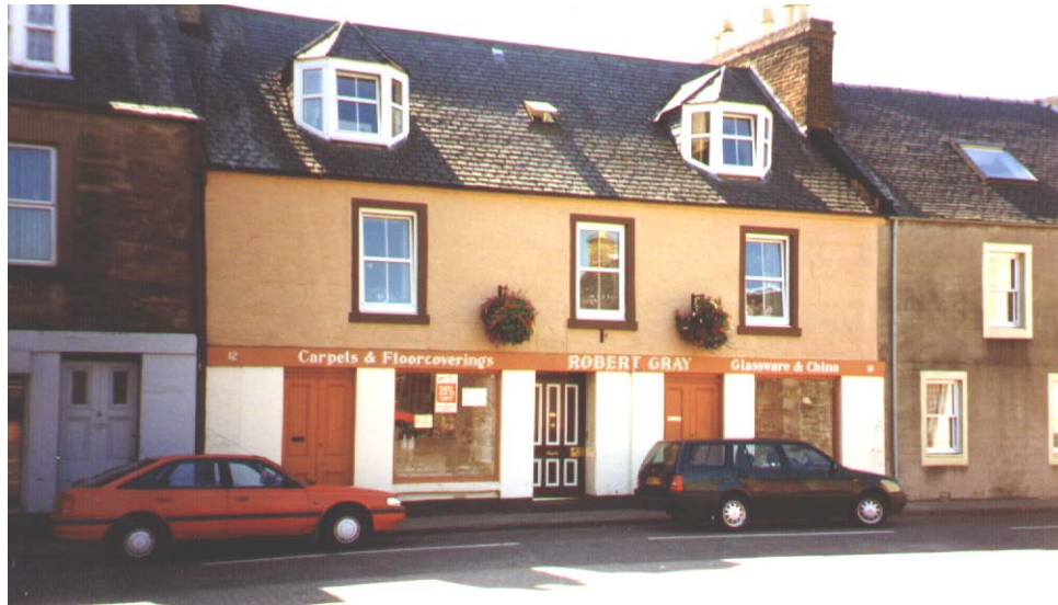
12-16 Commercial Street Coupar Angus in 1999