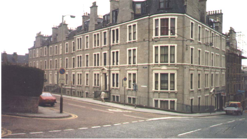
Rustic Place 1985