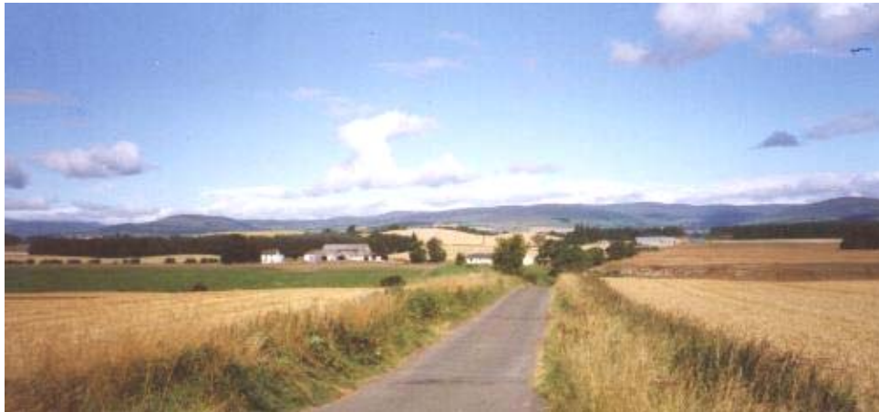
Looking northwards from the Forfar-Aberdeen road towards Birkenbush.