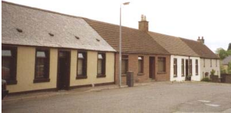
Houses in Archies park 2001

Only two children remain in the family home by the time of the 1851 census. Forfar (288) book 13, page 12.