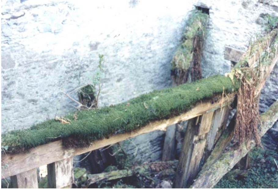
Decaying interior at Holemill 1988

Milton and Holemill are both towards the top right of this map: