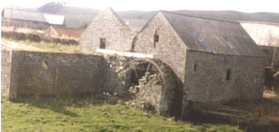
The mill wheel