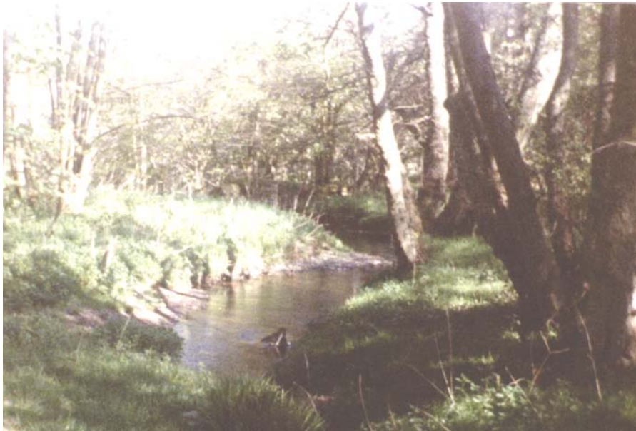
Overgrown mill pond at Holemill 1988