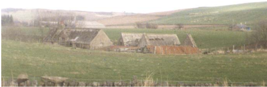
From a distance.