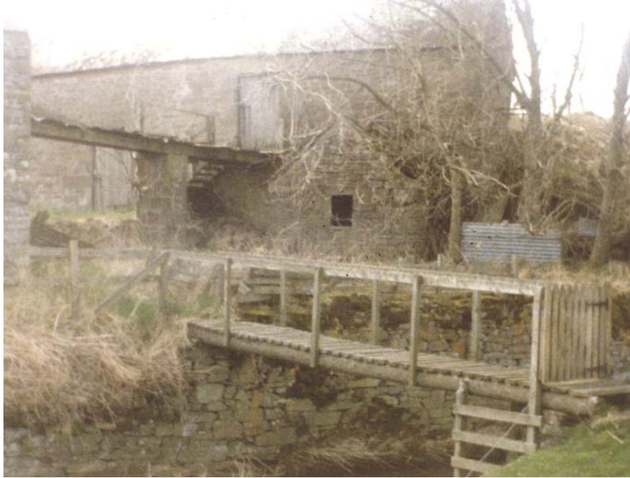
Part of the mill buildings