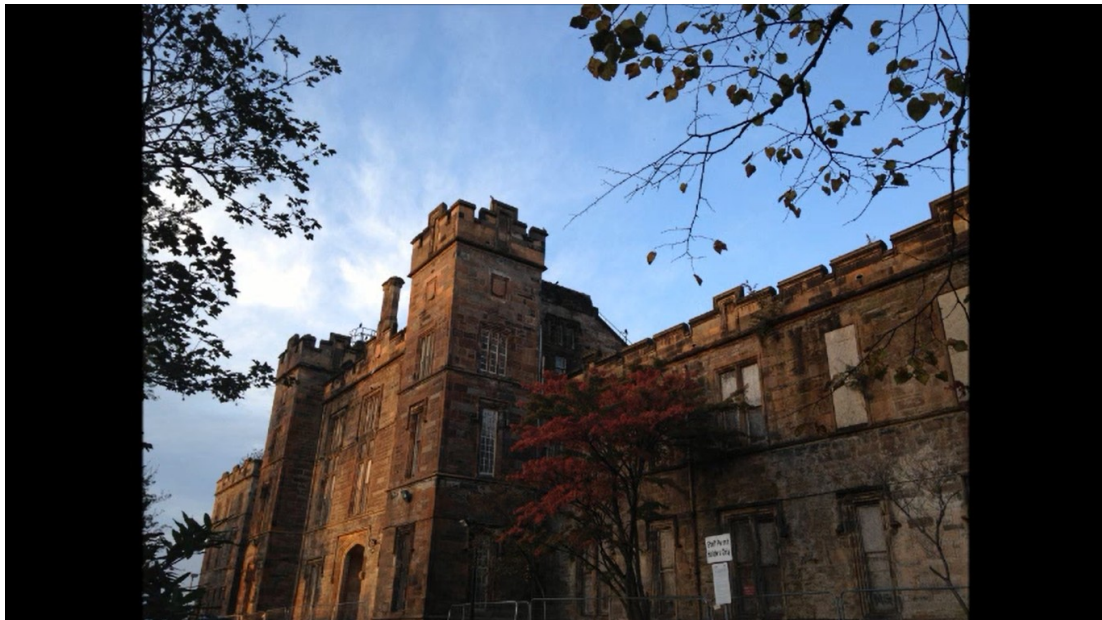
Gartnavel Royal Hospital after closure.

Has lost her memory to a great extent does not know her age; says it is six years since had a child while it is only five months, ( it was actually 9 ½ months ) complains of being badly treated, spoke angrily to her sister without any seeming cause. Threatened to blow her father and mother's brains out, takes a dislike to those whom she admired most; very angry if thwarted in any way.