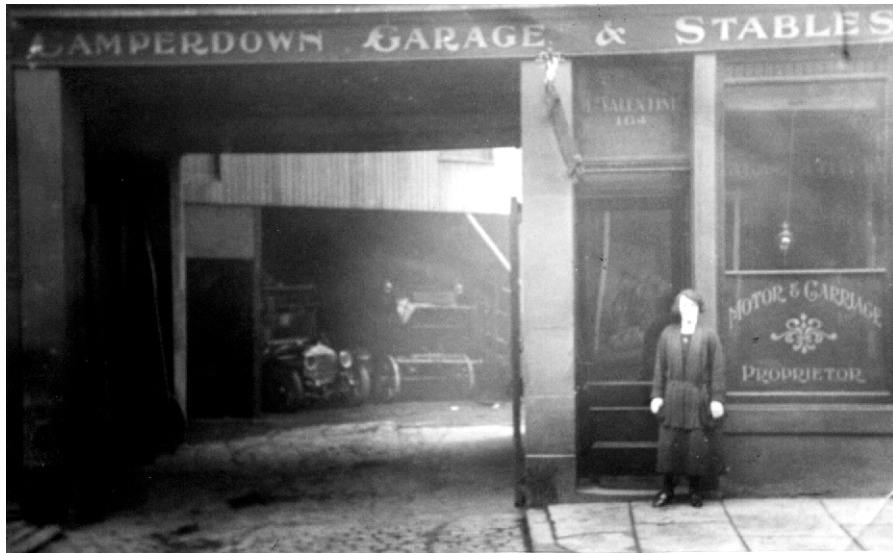
Camperdown Garage and Stables