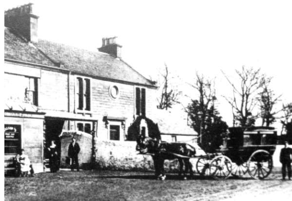
The "Birkie Bus" at its terminus, Birkhill Inn.

At one time the firm also owned the horse drawn "Birkie Bus" which ran from the end of the West Church, Lochee to Birkhill Inn, Birkhill. A further speaker describes the Valentines as delivering mail in the Birkhill area.