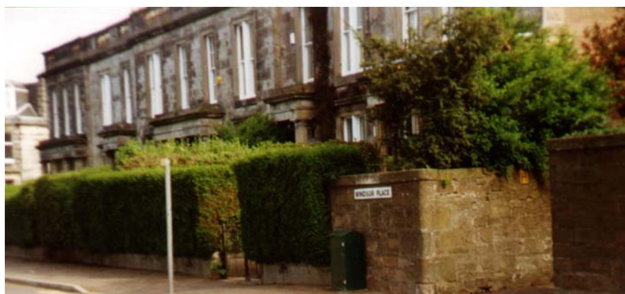
Windsor Place 1998. Little changed from 1867