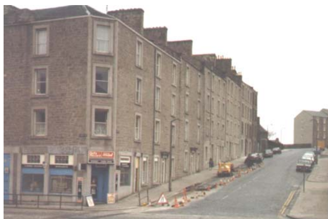
North Isla Street 1993 (Fraser house is on corner two up).