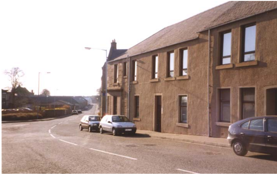
The photo above shows 22 Don Street, Forfar in March 2000. The Dobsons house was the top floor to the left of the close.

Addresses in Dundee were: 3 Isla Street (1893), 105 Strathmartine Road (1903), 333 Strathmore Avenue (1930's).