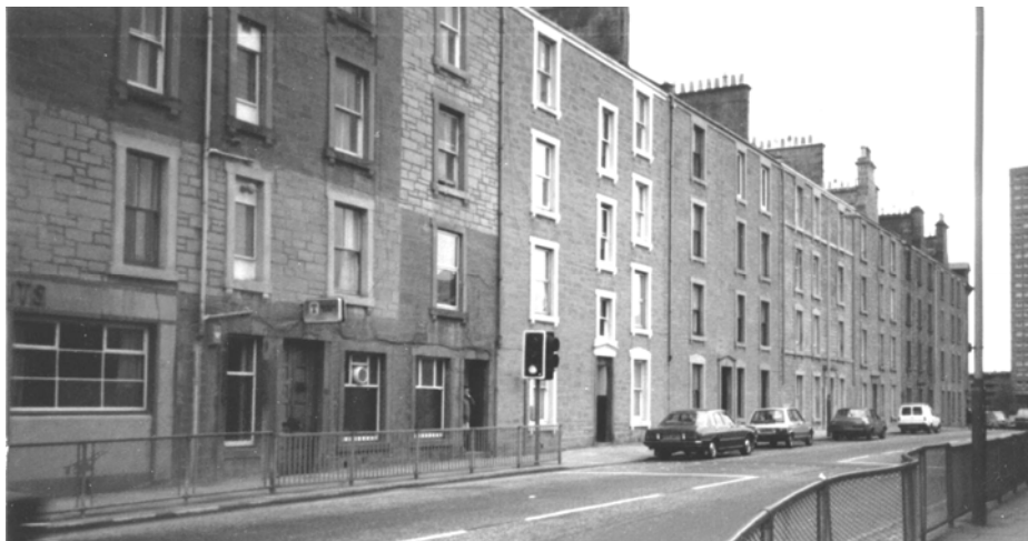
105 Strathmartine Road in 1988

Addresses in Dundee were: 3 Isla Street (1893), 105 Strathmartine Road (1903), 333 Strathmore Avenue (1930's).