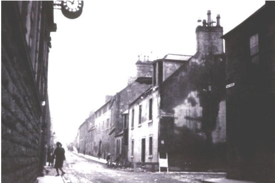
Gravesend/Applegate junction taken from Park Street (where Burnside Mills were) up Applegate. Gravesend is to the right. Taken c1920.

http://maps.nls.uk/townplans/view/?sid=74415128&mid=arbroath