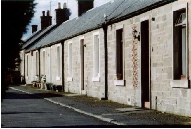
Back Row, Strathmartine 2004