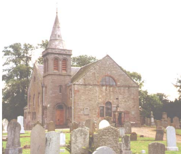
Two views of Kettins Church in 1999.

The church, which was only twenty years old in 1788 is probably the only building in the area which has survived from the time of George and Jean's wedding. The wedding of course would not have taken place in the church but at the bride's home. (The church bell is much older, being dated MCCCCXIX and was possibly looted in 1572 by mercenaries from Grobbendonk Monastery, in Belgium. A copy was cast in 2006 and is now in Grobbendonk).