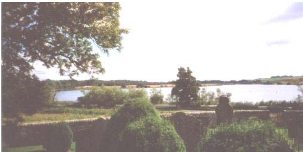
View over Rescobie Loch from the church 2001