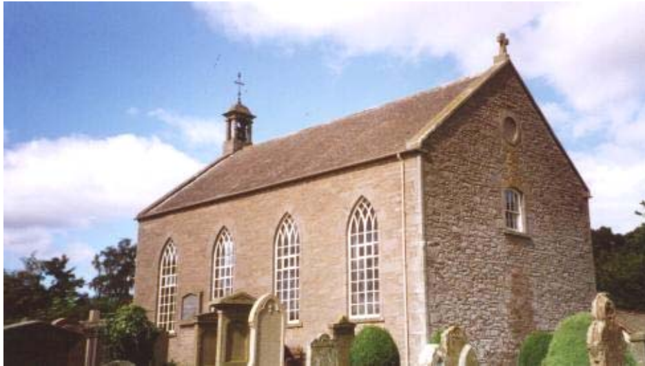
Rescobie Church 2001

(This seems to have been the recognized amount, given by all couples and is equivalent to £60 in 2001).