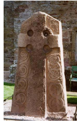
The Pictish Aberlemno Stone