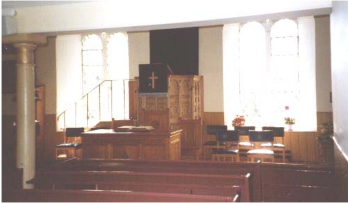
Interior of Aberlemno Church 2001