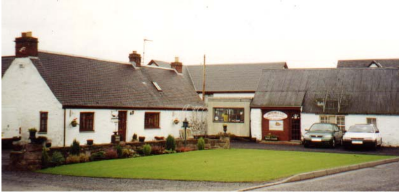
Kinrossie Smiddy 2000

whether they both worked in the same shop. One shop certainly existed in the village of Kinrossie and still exists in 2001 as a Blacksmith and Agricultural Engineer. Although the original buildings are still there, they are dwarfed by modern premises.