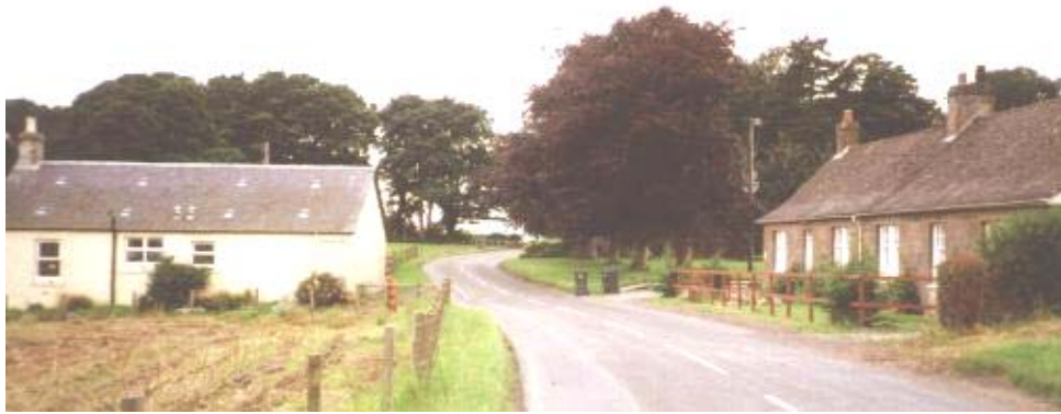
Modern cottages at Mains.